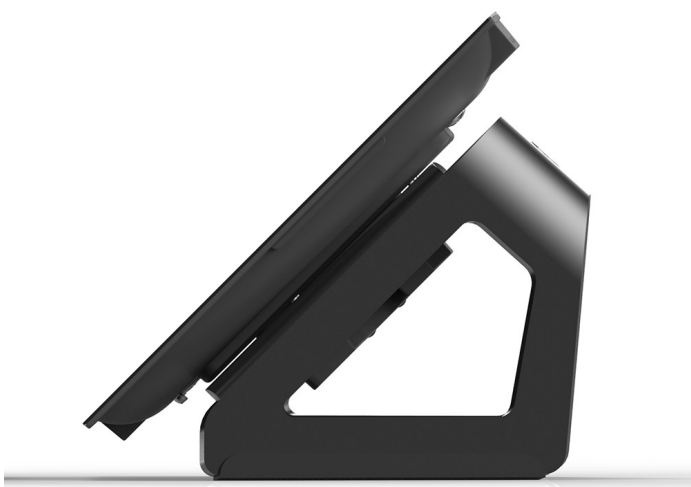
The Tabletop Stand is sold separately