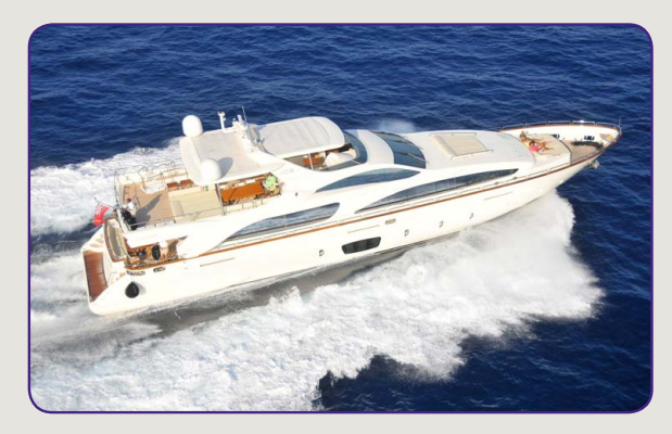
Dealer: Navicomm Marine • Calvia, Islas Baleares, Spain

Navicomm Marine Systems installed a fully integrated entertainment system in a 105-foot Azimut Motor Yacht. In addition to providing the yacht owner and his guests with an unmatched A/V experience, one of the primary goals of the installation was exceptionally reliable and simple control. To meet this requirement, Navicomm utilized RTI's XP-6 control processor and three iPads® running the RTiPanel app: one each in the yacht's saloon, aft deck, and flybridge.