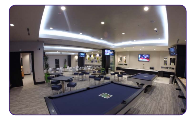
Dealer: Evolution Home Theatre, Inc. • California, USA

Increasingly, condominium and resort developments are evolving into high-tech communities where residents are surrounded by amenities that deliver immersive entertainment experiences, engaging social events, and spaces where quests can simply sit back and relax. When Garden Communities in San Diego was looking to construct a recreational center for its thousands of residents, only a state-of-the-art 40,000-square-foot facility would satisfy the development's desire to bring quests the absolute best in commercial recreation. Touting a bowling alley, sports bar, gyms, tech rooms, roof deck spa, karaoke system, and more, the uniquely designed center relies on RTI's advanced portfolio of innovative interfaces to seamlessly control all of its AV components. The result is a fun, engaging, and fully integrated environment that remains incredibly easy to use for any staff member or community resident.