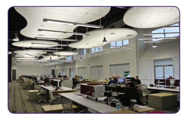
Dealer: iEvolve Technology • Texas, USA

For a multi-room, 80,000-square-foot space at Omni Flow Computers, the Texas-based company turned to RTI's advanced control ecosystem to make a state-of-the art AV system incredibly easy to use. Designed around RTI's XP-8s control processor, AD-8x audio distribution systems, and beautifully designed KX7 in-wall touchpanels, integrator iEvolve Technology was able to custom-build a user experience that takes no more than a few screen taps to operate.