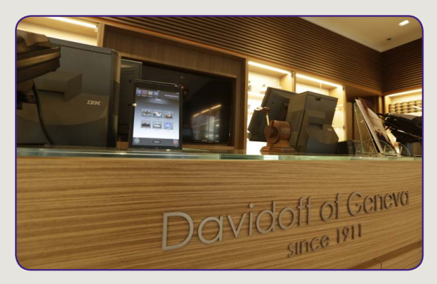
Dealer: Mattera Design, Inc. • New York, USA

Davidoff of Geneva's in-store branding revolves around combining high-tech media with sleek interiors. The cigar company's flagship store in Manhattan was looking to implement a comprehensive control solution that would provide the power to automate and easily operate the store's entire A/V system — without intruding on the location's meticulous visual presentation. By turning to RTI's sophisticated control and automation technology, integrator Mattera Design was able to maintain the Swiss brand's flawless appearance while creating an intuitive control experience.