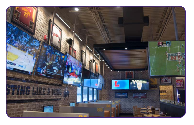
Dealer: VST Productions. Inc . Ohio. USA

For a busy Buffalo Wild Wings franchise in New Philadelphia, Ohio, live televised sports are key for keeping a constant flow of customers coming into the restaurant. With a total of 80 video displays paneled across the 6,800-square-foot space, ownership was looking for a solution that would allow staff members to operate the system easily, ensuring that fans never miss a second of the action. To tackle a project of this scale integrator VST Productions turned to RTI's powerful control solutions.