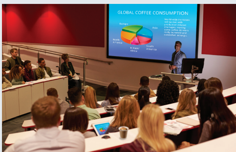
Education / Houses of Worship