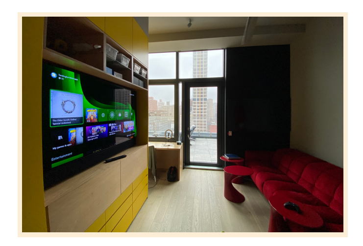
"The homeowners love that RTI gives them confidence that everything just works. It's seamless, easy — and smart."

RTI Control and Automation Solutions Deliver a Truly Simplified Smart Home Experience