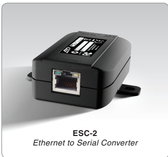
ESC-2 Ethernet to Serial Converter