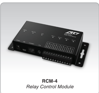
RCM-4 Relay Control Module