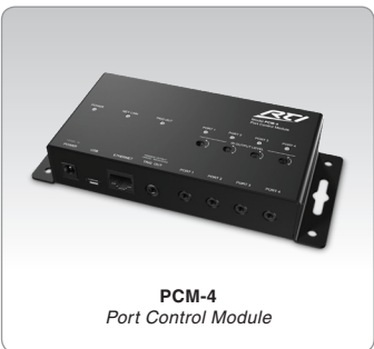
PCM-4 Port Control Module