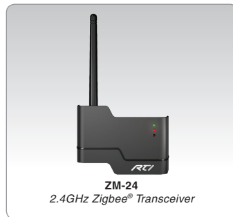
ZM-24 2.4GHz Zigbee® Transceiver