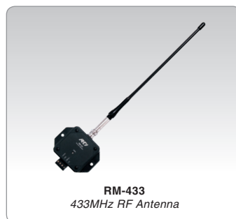
RM-433 433MHz RF Antenna