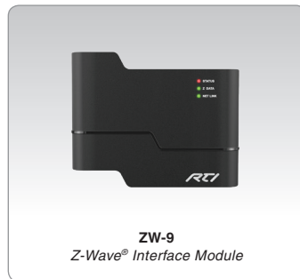
ZW-9 Z-Wave® Interface Module