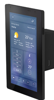
IST-5-B (Black Bezel)