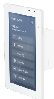
IST-5-W (White Bezel)