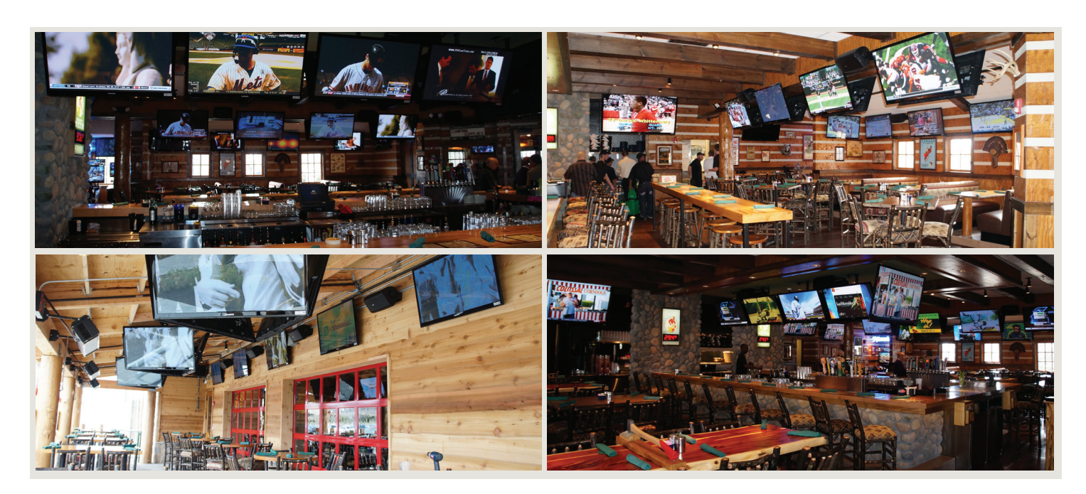
"Twin Peaks required a solution that enabled the staff to focus on running the restaurant, not the A/V system. With RTI, we were able to create a truly customized solution that is simple for the staff to operate and most importantly, extremely reliable"

Kansas City-Area Sports Bar Turns to RTI for Simplified Control of A/V System