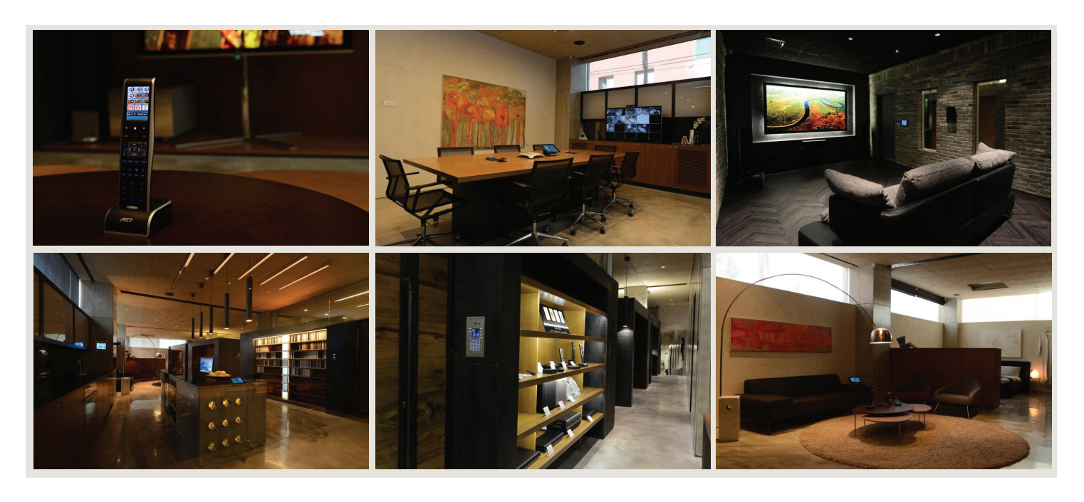
"We work with RTI because of the design and feel of the company's products, their high reliability, and advanced functionality."

Israel-Based Global Quality Provides its Customers With a Unique, State-of-the-Art Showroom